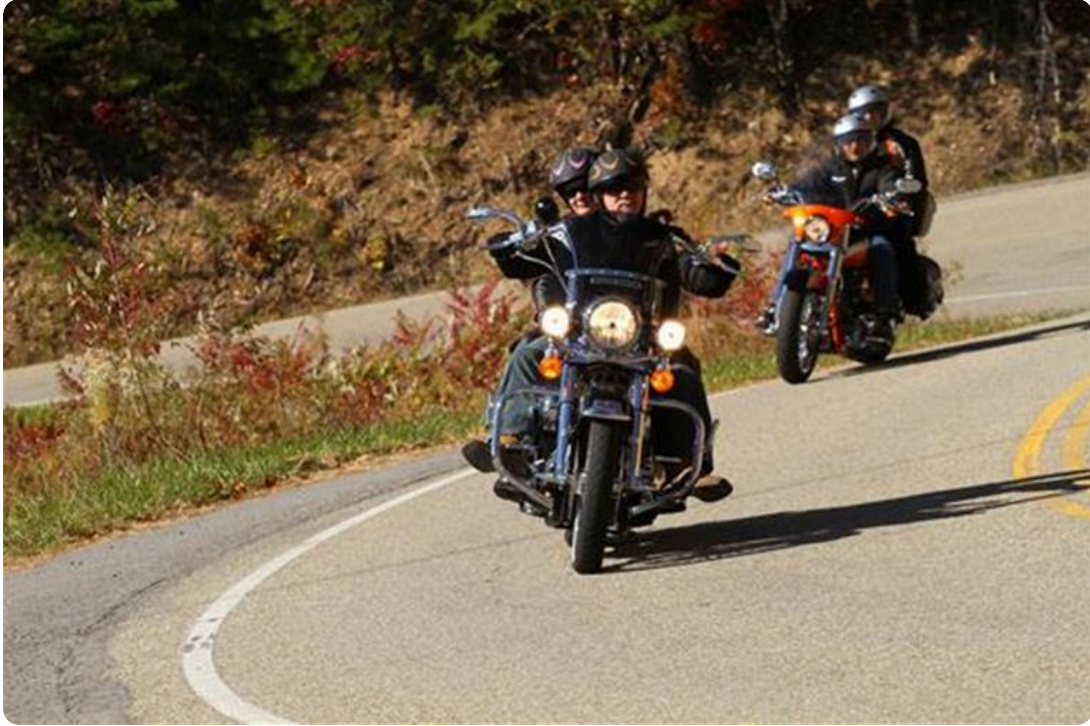
"In the Wind"